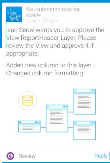
View approvals workflow

Yellowfin's content approval workflow has been extended to include Yellowfin Views (metadata), meaning the data preparation layer can run through an authorized sign-off process before being published – just like any reports, dashboards or Storyboards.